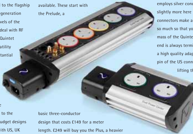
basic three-conductor design that costs £149 for a meter length. £249 will buy you the Plus, a heavier

There are also four power leads available. These start with the Prelude, a